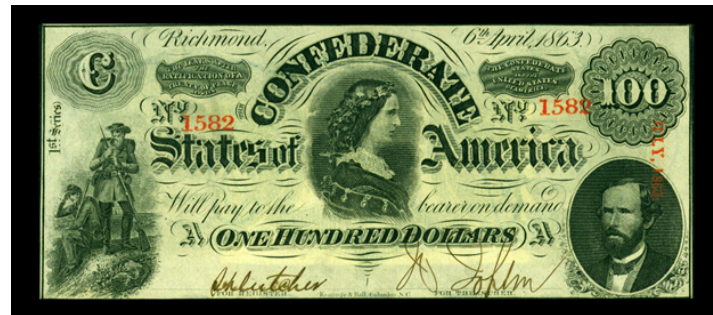
Confederate States of America $100 Bank Note dated April 6, 1863

We are delighted to announce the new spring temporary exhibit entitled “Currency During Wartime as Art & As Artifacts.” This exhibit will be held in partnership with the Hill College Quality Enhancement Plan (QEP), Financial Fitness topic for students. This exhibit will open the last week of March and run through the entire month of April for Financial Fitness Month and will end on May 12. Please stop by the museum to see this fantastic exhibit.